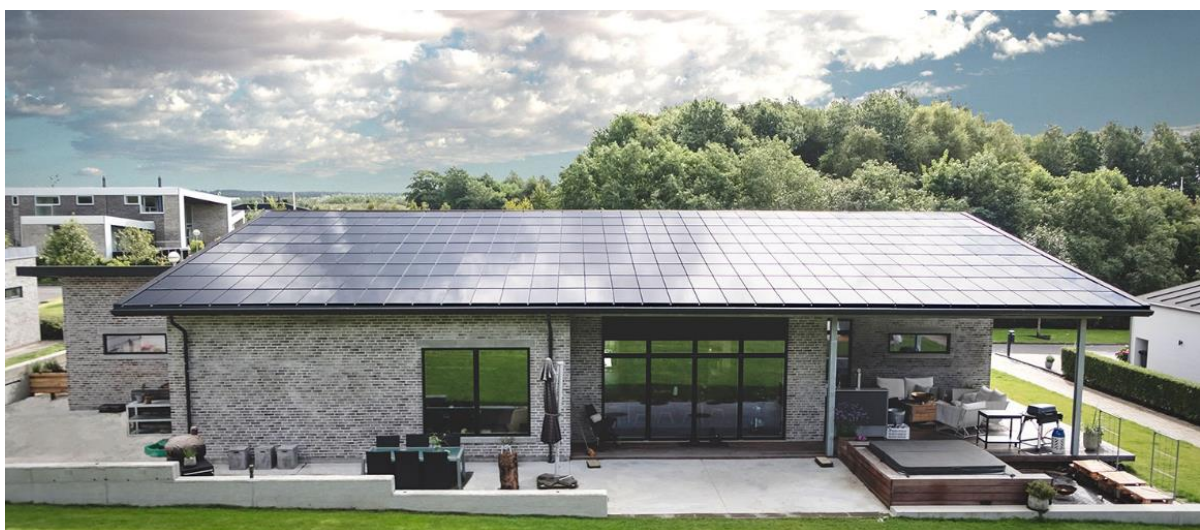
Example of BIPV roof by Ennogie at HC Lumbyesvej, Ikast, built in the year 2018