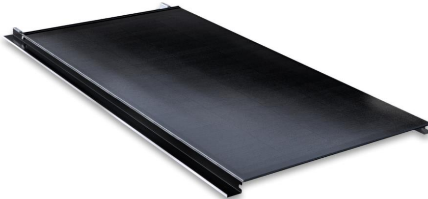
The BIPV module ERS-0191 (130W) produced by Ennogie ApS